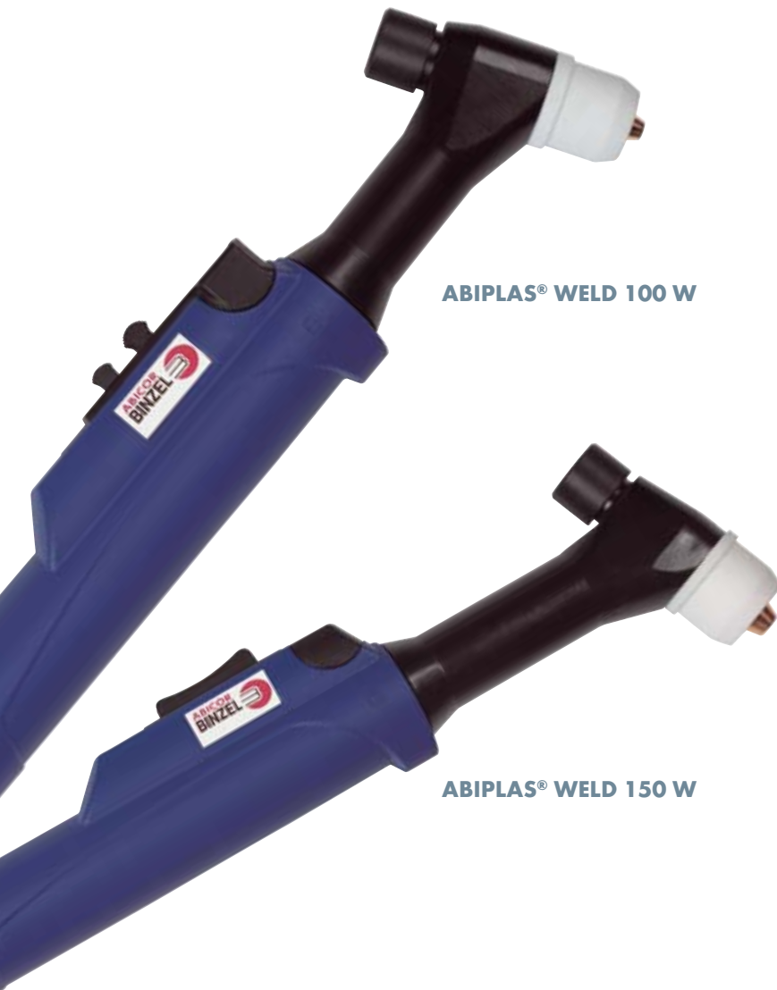
ABIPLAS® WELD 100 W

ABIPLAS® WELD the name of the new plasma welding torch generation, economical and efficient, from ABICOR BINZEL. Thanks to their compact design ABIPLAS® WELD torches improve accessibility even on difficult component geometries. The very stable process permits spatter free welding and brazing, with high quality joint characteristics. Suitable for both manual and automated welding.