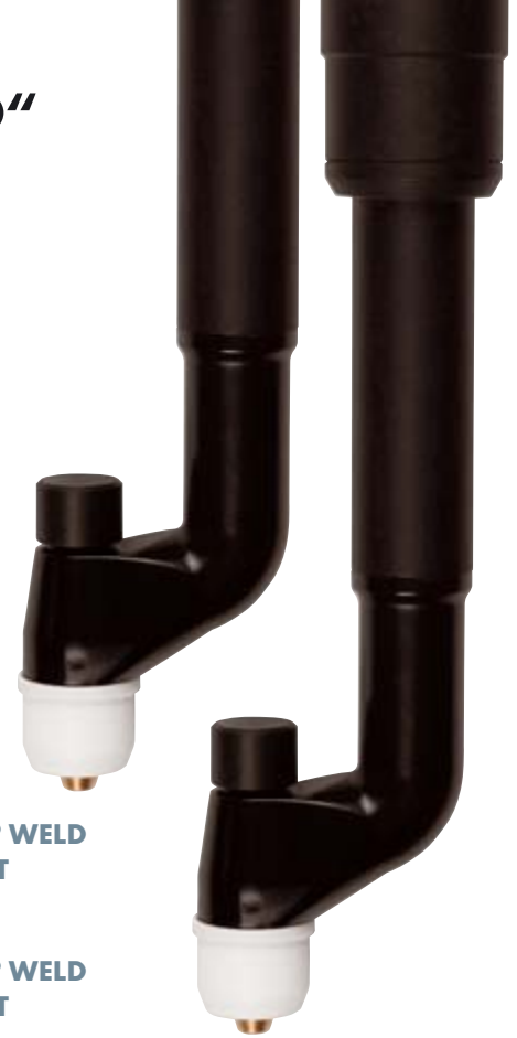
ABIPLAS® WELD 100 W MT